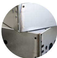
THIN SHEET FABRICATION