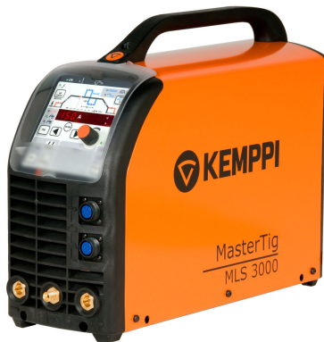
MasterTig MLS 3000

MasterTig MLS 3000 sets the standard for industrial TIG welding. Precise and refined welding quality for workshop or site use, MasterTig MLS 3000 has become an industry standard, offering the necessary performance in a lightweight and portable design. This welder is a 300 A version.