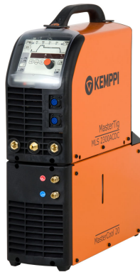
MasterTig MLS 2300ACDC

MasterTig 2300ACDC is a 230 A version with 1-phase 230 V power supply. This welder offers TIG welding professionals the necessary control to meet their exact needs.