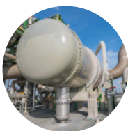
PRESSURE VESSELS AND BOILERS